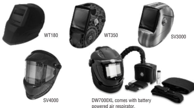
DW7000XL comes with battery powered air respirator.